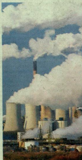
EARTH FILE: More gases will cause greater warming sooner rather than later. A coal plant in Gelsenkirchen, Germany.

A slowdown in warming at the surface and top layer of the oceans in recent years may have fed scepticism. But this was puzzling for some, for there has been more energy trapped by greenhouse gases than this recent slowing in surface warming warrants. It now turns out it was misleading. A new paper reveals that changes in surface winds may be taking this missing excess heat into the deeper oceans, causing "unprecedented" warming of those waters. "In the last decade, about 30% of the warming has occurred below 700 metres, contributing significantly to an acceleration of the warming trend." (Magdalena Balmaseda, et al. , "Distinctive Climate Signals in Reanalysis of Global Ocean Heat Content," Geophysical Research Letters , March 13, 2013, doi: 10.1002/grl.50382). The slowing is on the surface, literally and